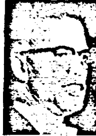
Malcolm X ... hypnotic manner

knives, pens, even nail files. They took my little camera. I looked worried. The guard said 'Don't worry, man, you'll get it back.'